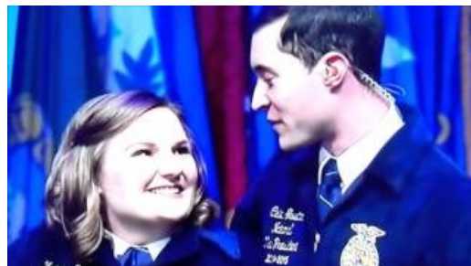
88th National FFA Video